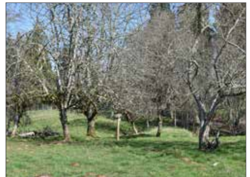
Excellent privacy on the back of the development