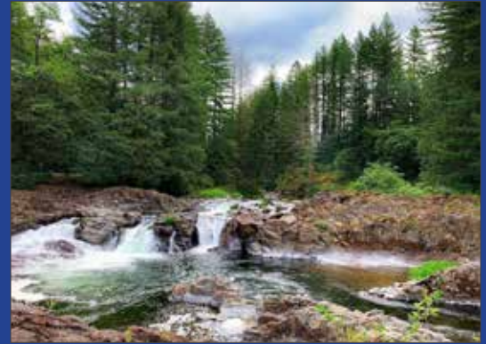
Lucia Falls Regional Park

E i U] FYsgYfj Y is a new residential community primed for new construction homes. Only five lots are available and they all adjoin a private greenbelt. Located on the east side of Battle Ground, this neighborhood is only minutes from Battle Ground Village, a charming shopping center with excellent dining options, a coffee shop, professional services and more.