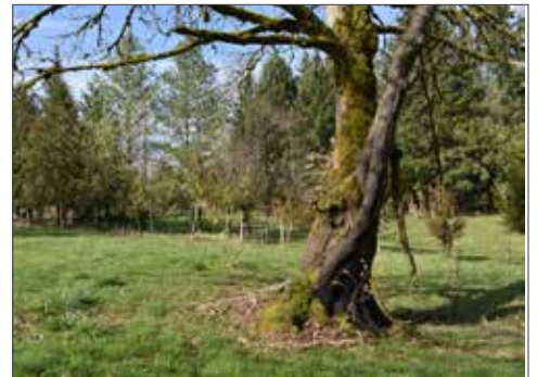
Property adjoins a private greenbelt

www.nwhomebuildergroup.com/quail-reserve-3-subdivision/