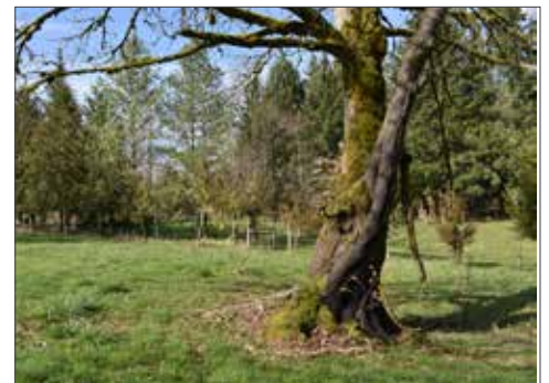
Property adjoins a private greenbelt

www.nwhomebuildergroup.com/commerce-meadows-subdivision