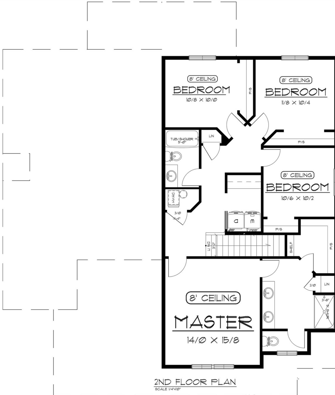
2ND FLOOR PLAN SCALE 1/4"=1'-0"

Lot 26 Stonewood ADU Total 2779 sq ft Primary 1985 + ADU 794