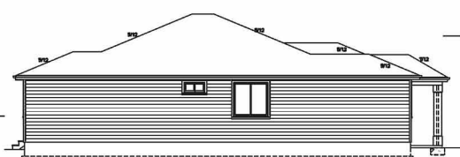
LEFT ELEVATION SCALE 1/8" = 1'-0"